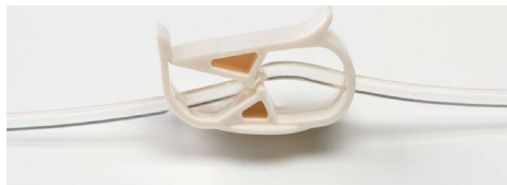
Closed position, pump is not infusing.