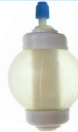
Image of a FULL pump

At the beginning of infusion the inner membrane and soft outer cover will be taut, the pump will be round and firm.