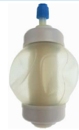
Image of an EMPTY pump

At the end of the prescribed infusion time the inner membrane will completely deflate & the soft outer cover will collapse.