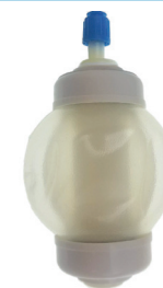
Image of a pump DURING infusion

During infusion the inner membrane will decrease in size and the outer soft cover will begin to form wrinkles.